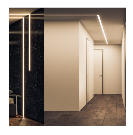
*Mitre joint Customization Available